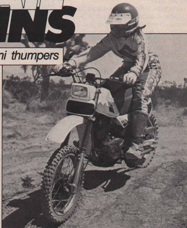
Slightly more available horsepower makes the DR125 more fun for bigger kids or adults.