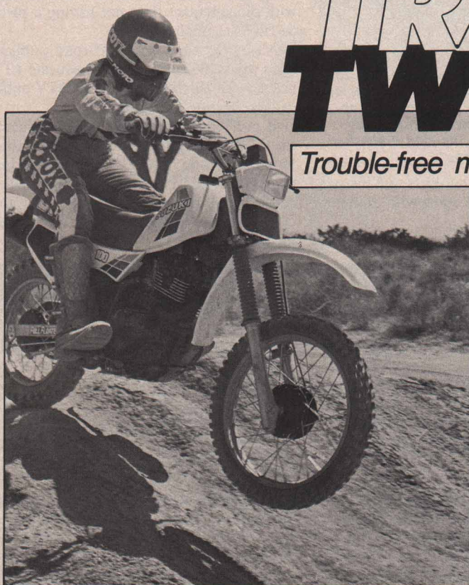
The smallest DRs make ideal trail bikes and can still be pushed a bit if the rider's size is matched to the bike.