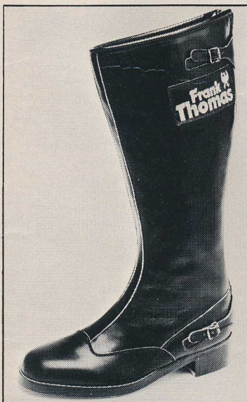
The 'Suzy' boot, made specially for ladies by Frank Thomas boots. It sells for £29.50. The fur-lined 'Alice' cost £31.50. Both styles of ladies touring boot are produced in sizes 3 to 8.

When I've asked about smaller boots for those of us with small feet I've usually been met with the answer "Wear plenty of thick socks to fill them out". For a start I don't really want to look like some sort of Minnie Mouse and, secondly, have you tried wearing loads of socks in summer? It's no joke.