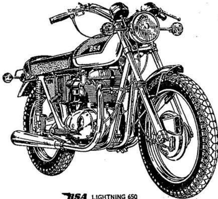
BSA LIGHTNING 650