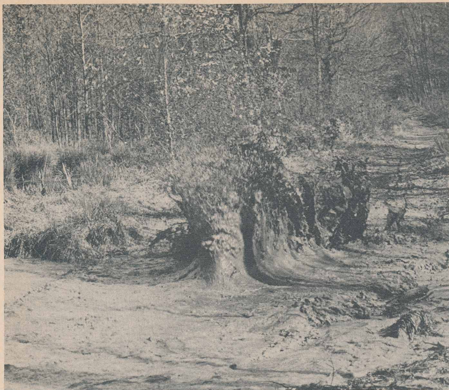
"Torpedo off the starboard bow, Sir."

some sore, twisted, wrenched, split, smashed, or bashed body part, preparing for that endless journey home, and all the time proclaiming, "Jeez! Wasn't that fun!"