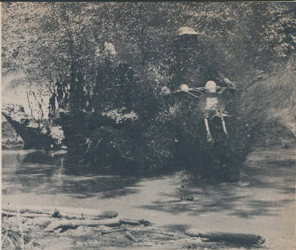
"Just sin-n-n-ging in the rain."