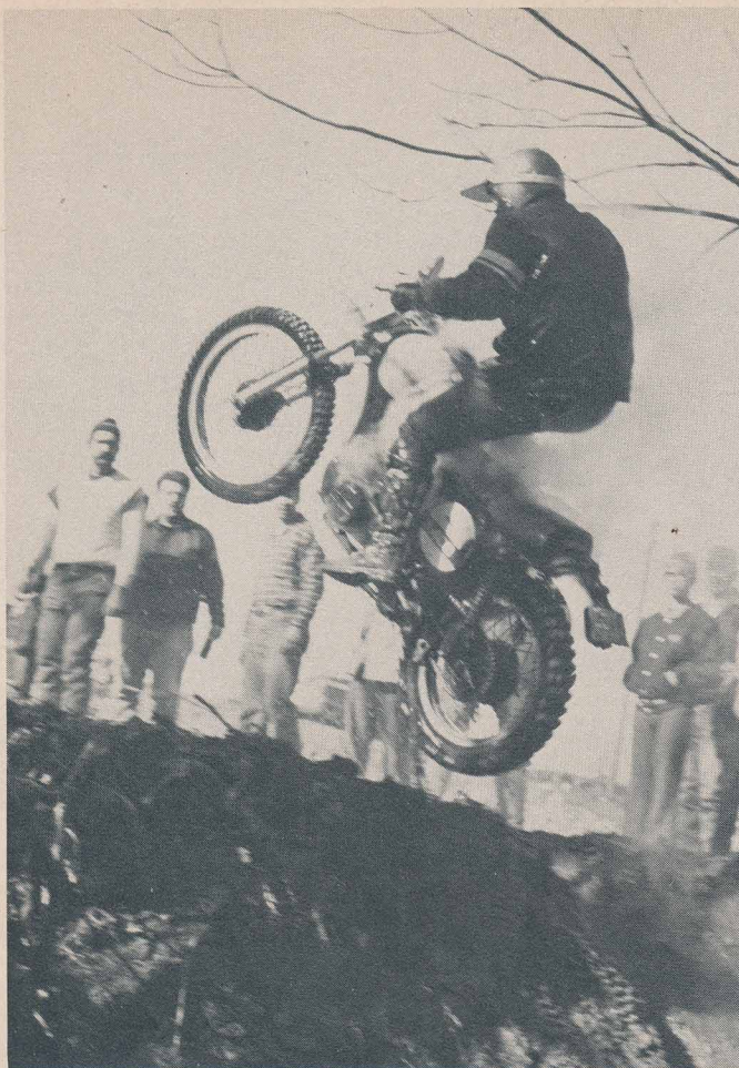
"Ah, he's no fun."