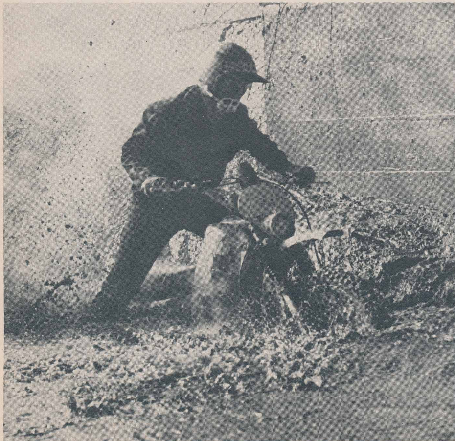
"Heh, heh. Just wait till the LATE numbers come through here."

is perfect for training and graduating top-notch talent. The terrain incorporates practically everything but desert into the enduros: steep hills, swamps, fire roads, creeks and rivers, mud, water, logs, rocks, brush, trees, strip mines—you name it—it's available. Furthermore, Ohio has something nearly unique to their enduros: hard-sided, slick, deep, narrow, clay/mud ruts running in packs lengthwise down the trail. When you get in one of these babies you feel like you're trapped in a giant slot-car track. Get a bit out of shape and you are gonna go down, 'cause they're too narrow to steer in and too slick and steep to get out of. You can actually be in the process of helplessly crashing for about a hundred yards before you even hit the ground . . . gads, it's like seeing the giant shithammer coming at you for an hour-and-a-half and not being able to do anything about it. Ultimately, you learn that there are two ways of riding the ruts: very slowly while paddling and footing it, or very fast, stabbing now and then. Anything in between and you crash. But clay ruts, power lines, woods trails, whatever, it's all fun . . . that is, if you're a typical crazed enduroist.