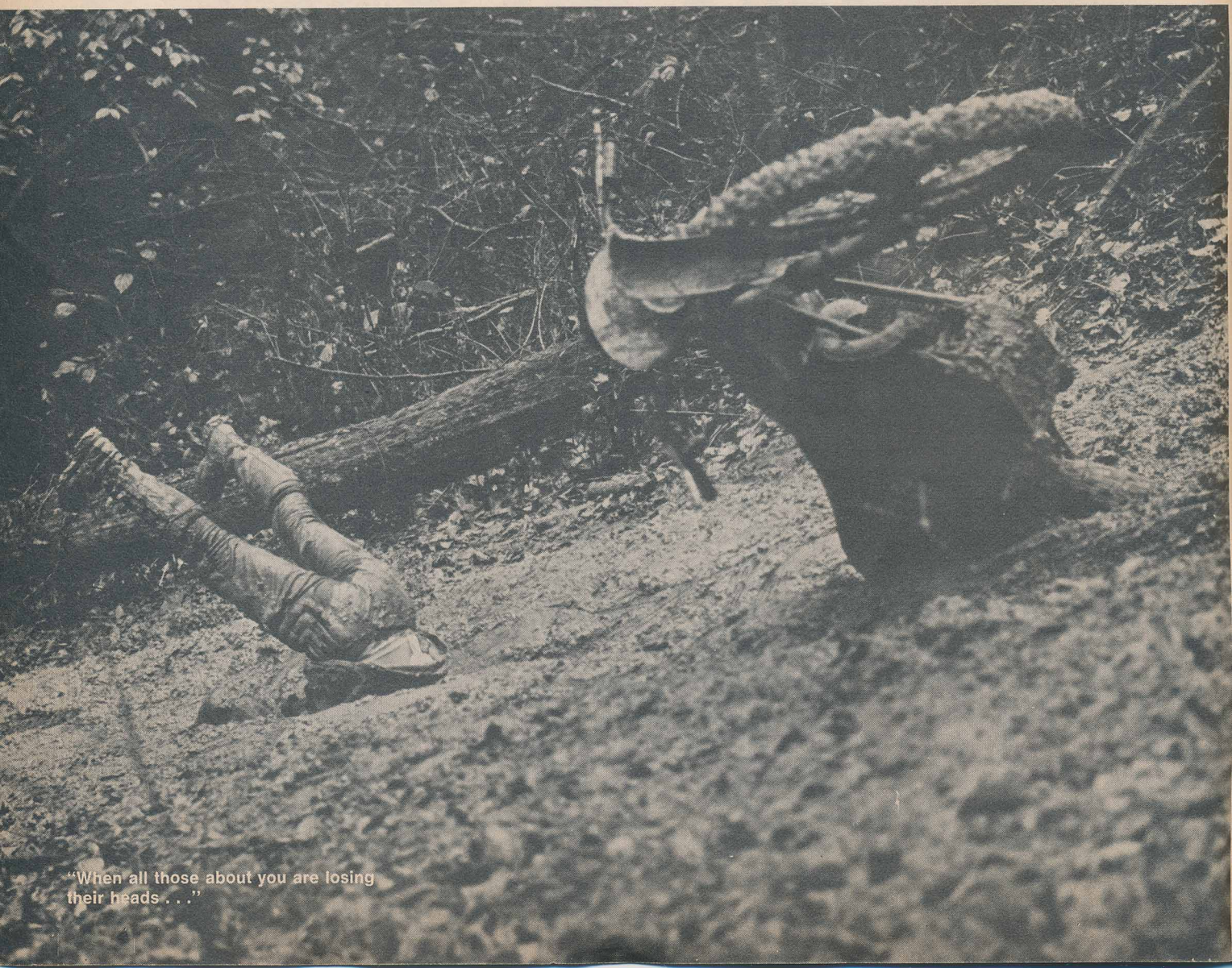
"When all those about you are losing their heads . . ."

Actually, I exaggerate but slightly when I claim a never-ending Ohio enduro, for even here enduros end. But lemme tell you what I'm trying to say: The 1976 southern Ohio enduro season opened in the rain on February 22 and closed in the snow on November 21, and in that interval Ohio AMA District 11 ran twenty-nine sanctioned enduros . . . that's right, I said 29 enduros in