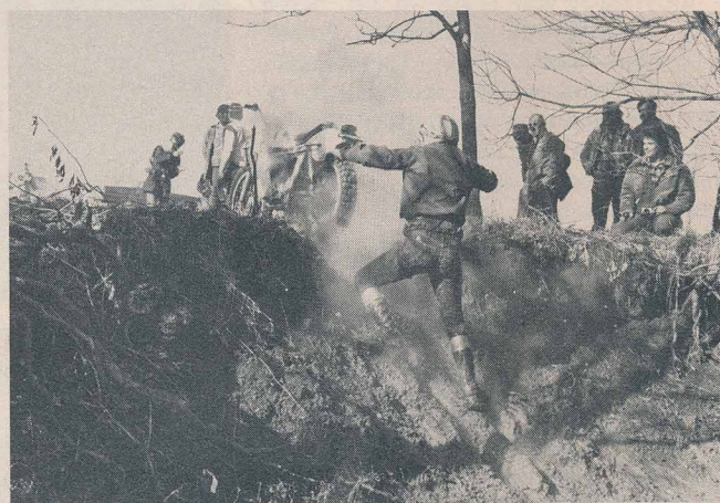
Rigor Mortis Man returns from the swamp.