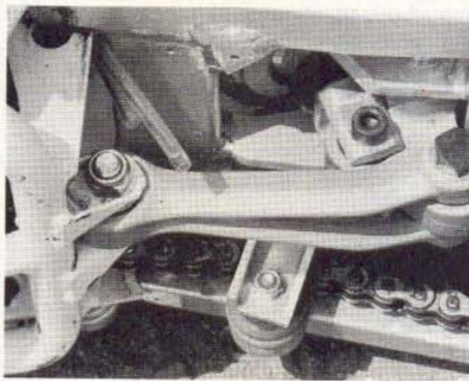
A new linkage ratio and clevis-mount Ohlin shock grace the 250's tail. The spring is too soft, and there's too much low-speed rebound damping.