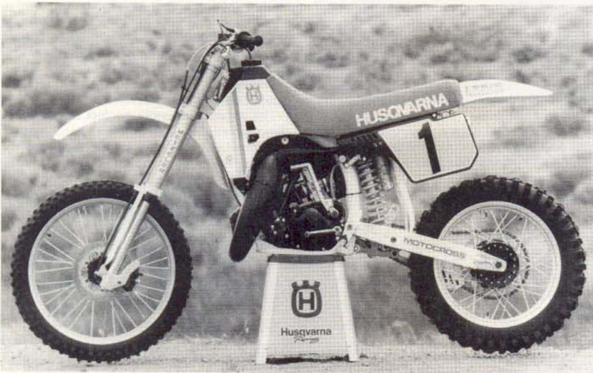
While the Husky 250 Motocross looks unchanged (except for the addition of the White Power fork), this couldn't be farther from the truth.