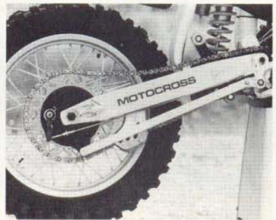
Although the full-floating brake setup performs adequately, a rear disc would certainly reduce unsprung weight and aid wet-weather stopping.

the solenoid. The Husky micro-processor ignition has the capability to do other things as well, but they've left those things for future machines—like meter intake pressure and temperature, which is something the KTM unit cannot do.