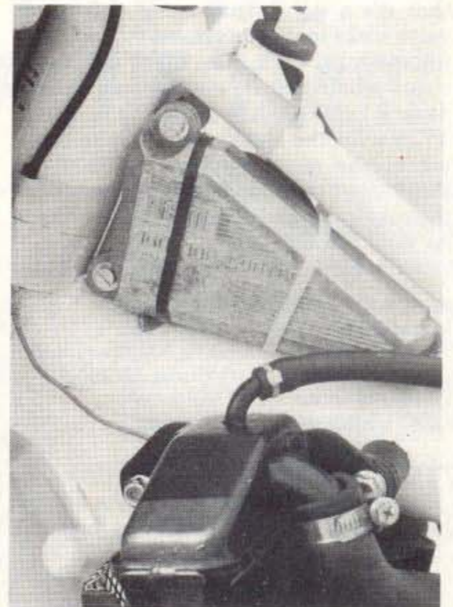
Husky's micro-processor ignition is similar to the KTM's except that it triggers the power valve, which kicks in at 6000 rpm.