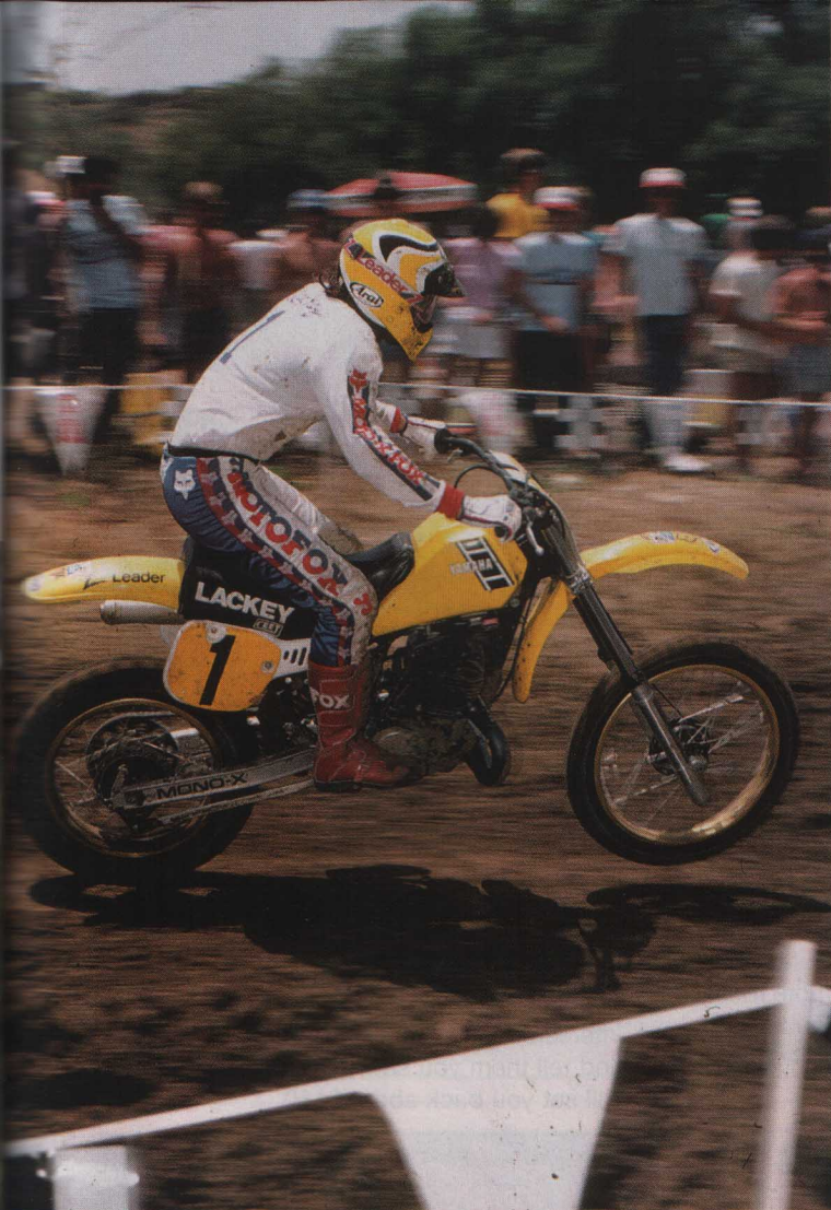
Brad Lackey was the perennial crowd favorite at Carlsbad, although he never won. It was only fitting that the 1983 USGP was the only race where he actually carried the number one plate. Brad had retired after finally winning the world championship in 1982, but came back for that one last race.