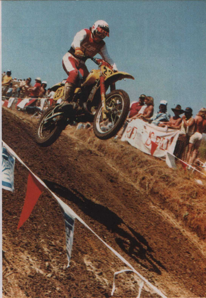
1980 was the beginning of a new era in world motocross. Marty Moates won both motos of the USGP, becoming the first American to do so. After that, the flood gates opened and the race was won by Chuck Sun, Danny Chandler, David Bailey, Broc Glover and Rick Johnson.