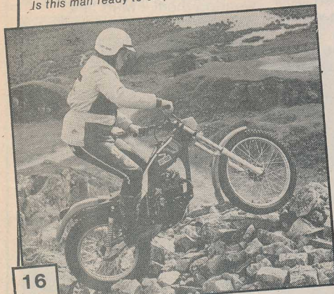
Is this man ready to step out on to the moors?