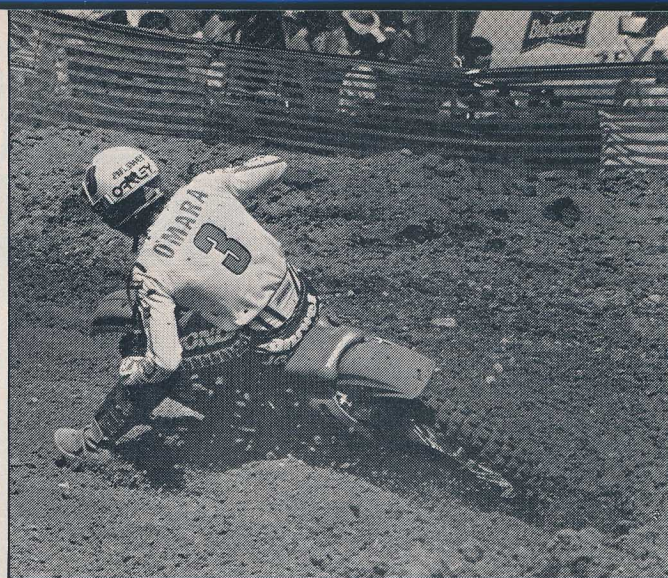
Johnny O'Mara took his HRC250 Honda on a late-season winning spree. Johnny won the final round at Washougal and tallied enough points to beat Rick Johnson for the 250cc runner-up spot in the overall points standings.

◀ After carrying the Number One plate in the 250 class in 1985, Rick Johnson will have to settle for a higher digit in '86. Rick was in the hunt most of the season but his overall points tally fell short in the end.