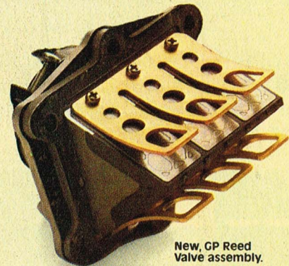
New, GP Reed Valve assembly.

More Power. Take a close look at the engine. Works bike technology has given