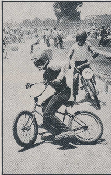
Yamaha plans to take the series nationwide in '75. Naturally, promotion for their Moto Bike is part of the picture, but none of them have won. The hot setup is homemade monoshock frames, it seems.

When you're serious about carburetion . . . consider the LAKE INJECTOR.