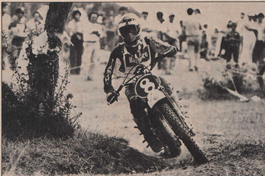
Most of the track was tight and twisty with trees on many corners.

On the way to Florencia, one can see trailers with bikes and trucks with more bikes. Just like the crowd that heads out to your track on any given Sunday. We glance at the skies. It's dark and ominous. Black clouds mix with fat looking grey rollers. No sunshine is breaking through. We mention to Luis the possibility of rain ruining the day and he dismisses it with a wave of his hand. "No way. It never rains during the race. Maybe before and