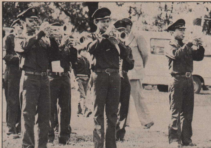
A genuine military marching band was part of the pre-race ceremonies.

All too soon, the festivities are over and it's back to the realities of race day. Practice goes off by classes; enough to warm up, but not really sufficient time