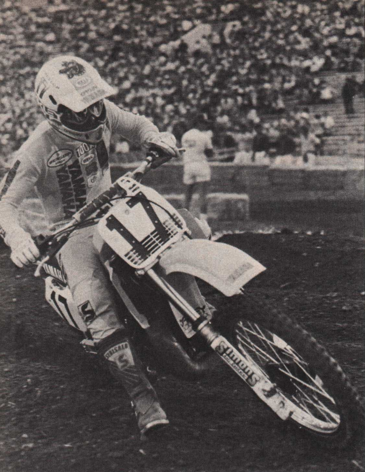
Fresh from a Supercross win in Orlando, Yamaha star Ricky Johnson suffered poor starts all night long. He gated especially bad in the Final, but managed to berserk his way into eighth place.

At a pre-race press conference, Broc Glover said his mediocre finishes so far this year were due to his "not caring, watching too much TV, and not working out or practicing." What a kidder, that Broc. He led for most of the Main, and finally got stuffed in to a hay bale for second. He never lost his visor, though.