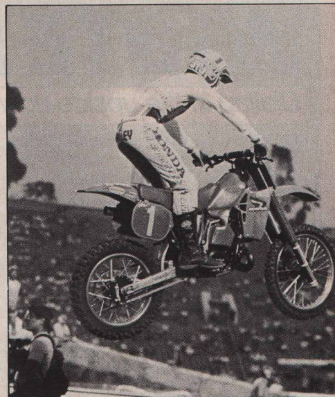
David Bailey really does worry about the future of motocross. Because of that number one on his plate, he's taken on the job of spokesman for the troops, and he spent most of the night getting more and more depressed about the track conditions. "We're not used to this," he said. "We could have spent the week at Ascot if we knew it was going to be like this." He finished fourth.

David Bailey told us, "I hope you guys don't write another rave story about this race. You should make sure everybody knows it was a TT track. This is ridiculous." Jeff Ward complained long and hard, and Mark Barnett said, "I think it'll be perfect—as long as I get the holeshot. Nobody in second place will have a chance on this track."