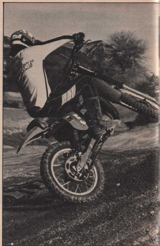
Tallest of the Big Four test bikes, the Honda CR125R looked and felt more like a 250 than a 125.

Third is YZ country, and it's very close to the KX. Only a fraction more than a point separates the two bikes. And if cost is the biggest factor, that