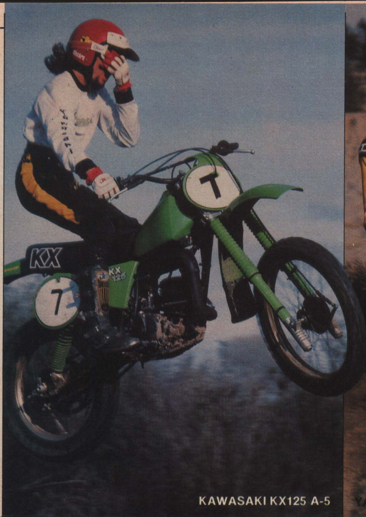
KAWASAKI KX125 A-5