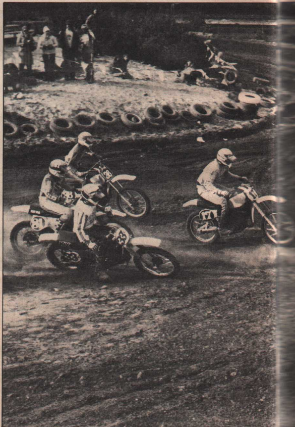
Here's what it all boils down to: the start straight. More often than not, this was the scene repeated at tracks all over the world this year—