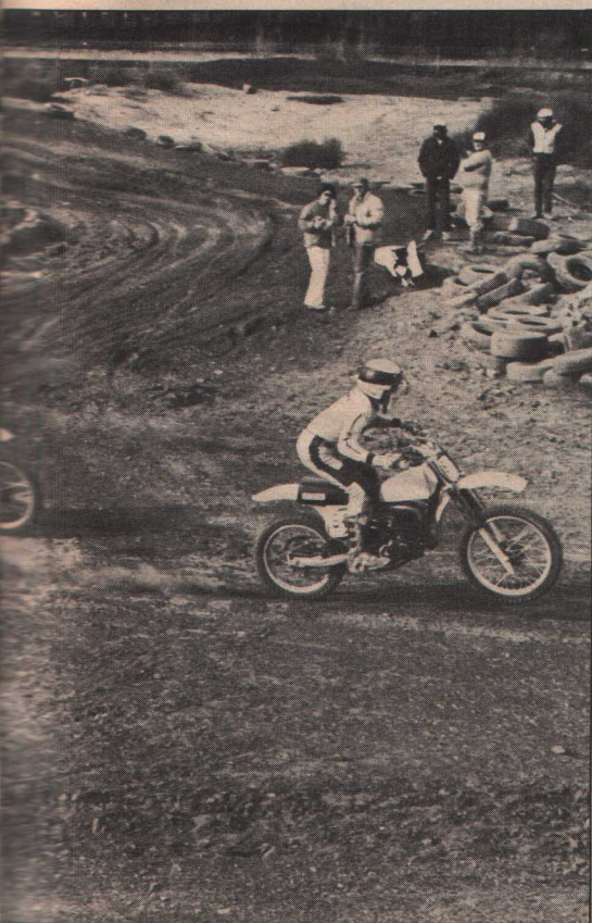
the RM125 Suzuki bolting into the lead, followed by the rest of the pack.