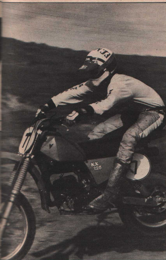
The KX125 A-5, only a second-year effort for Kawasaki, proved to be a worthy challenger for King of the Hill.