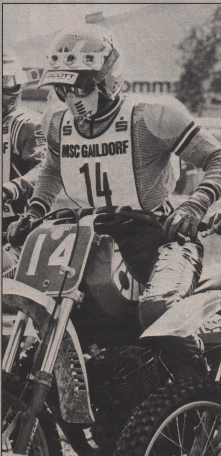
Even on the Grand Prix circuit, party leaders tell their riders that the Czech-go-slo-vakian bike is as good as LaPorte's bike.

Mikuni, depending on the track. Basic reed induction let the mix into the engine. The Czechs run Castrol oil at 20:1. Ignition is Motoplatt.