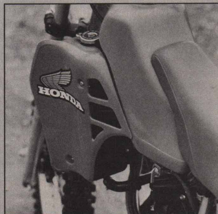
Resembling its bigger brothers, the little CR has a smart saddle/tank/radiator setup. All of the craftsmanship is top-notch.

Shifting has been improved and a folding lever has been added. Both the shift lever and brake pedal stick out too far, making for easy bends in a crash. The preload is adjusted via a screw-type setup like the big CRs, not a cam as in the past. It's a tight fit where the reservoir bolts up. Mounted right next to the shock itself and directly under the pipe, testers complained that it bothered their legs.