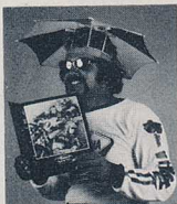
JT CATALOG 09-099 $5.00

1980 -- A HOT Season for JT Riders Between Howerton, Sun, Glover, and LaPorte 2 out of every 3 races were won using JT HOT STUFF! From the L.A. Coliseum to St. Pete, Florida; from Unadilla, New York to Washougal, Washington; from Pontiac, Michigan to New Orleans; HOT STUFF the leading edge.