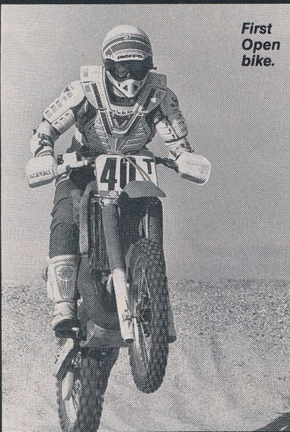
First Open bike.