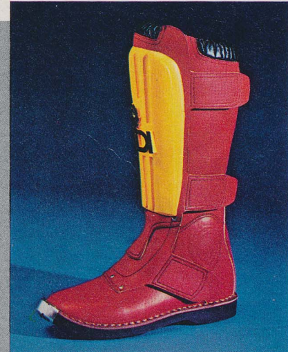
MOD. SUPER PROFESSIONAL

WINNER OF 250 AND 500 WORLD MOTOCROSS CHAMPIONSHIP