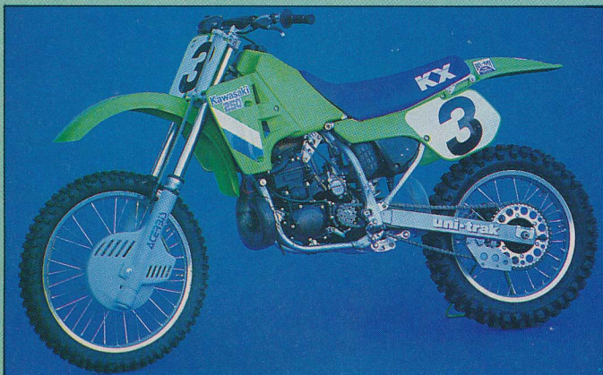
Works production: The AMA production rule didn't stop Wardy from winning the 1987 supercross crown. His SR250 bristled with works triple clamps, a two-piece magnesium clutch cover, works KYB suspension, a glide plate and a removable subframe, but it wasn't as trick-looking as the '87 Hondas or Suzukis.