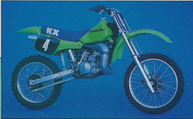
Really works: This '84 SR125 carried "The Flyin' Freckle" to his first championship over Mark Barnett. It also carried the first KIPS power-valve system and launched Ward to eight firsts and two seconds out of ten rounds. Check out the works aluminum gas tank, remote reservoir shock and works chromoly frame.

but he's the only rider ever to win titles in all of the classes—125, 250, 500 and supercross.