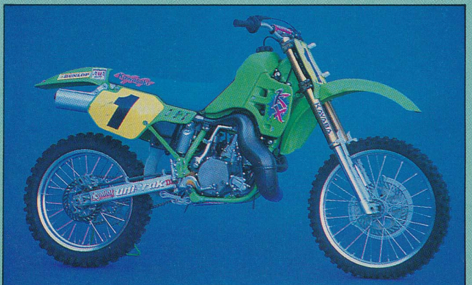
Works is works: There's not much difference between Ward's '89 and '90 SR500s, externally. The inverted fork was improved and lost the external bumper, and the works KYB shock was also upgraded. The rear axle carrier is magnesium, as are the axle blocks. Check out the works triple clamps and sponge under the brake pedal. □