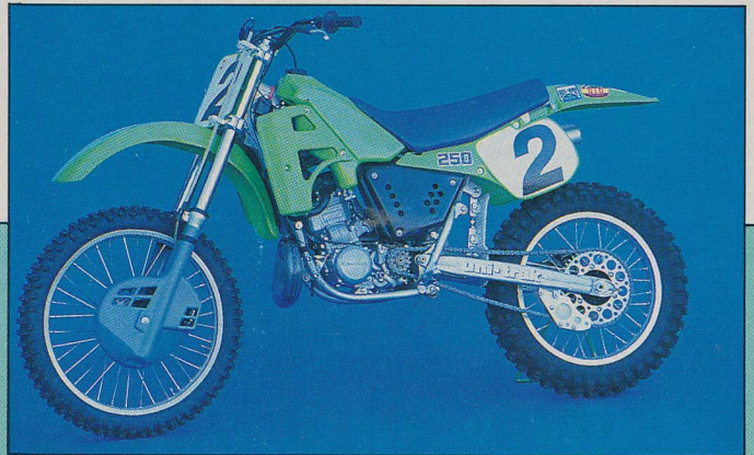
Last real works: Wardy moved to the 250s in 1985 and cleaned up on his SR250, winning both the 250 supercross and outdoor titles. The SR featured an aluminum tank and swingarm, adjustable fork preload and a remote reservoir rear shock with adjustable compression damping. Kawasaki dropped the dogbone Uni-Trak the next year.