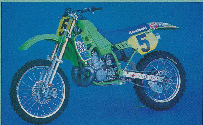
Works-R-Us: The '89 SR500 that carried Wardy to his sixth title and championship sweep doesn't look all that trick, except the suspension. Check out the external bottoming bumper on the works KYB fork. The machine also bristles with magnesium, titanium and works aluminum pieces to shave weight.