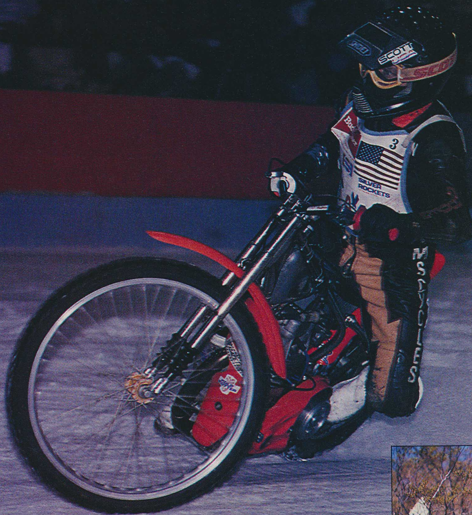
Speedway bikes on ice: Studded tires, methyl alcohol and ice form a heady concoction for American and European gun slingers. Short, intense, smoke-filled races remind the fans and racers of the shootouts of the Wild West.

T he event: the World ICE Racing Finals. The place: no, it's not Oslo, Norway, nor is it Siberia, Alaska or even Saskatchewan, for that matter. How about Tucson, Arizona, the desert and cowboy capital of the world? That's right, folks, smack-dab in the part of the country where daytime temperatures can hit the 80s in January. What's the catch, you ask? It's simple—the track is laid out on an indoor ice hockey rink!