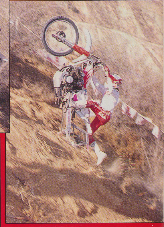
Some riders' machines carry Western Hillclimbing's "sky's the limit" rules for open exhibition machines to the absolute extreme. This Honda's landing sickened spectators and set off earthquake alarms in Los Angeles. ►