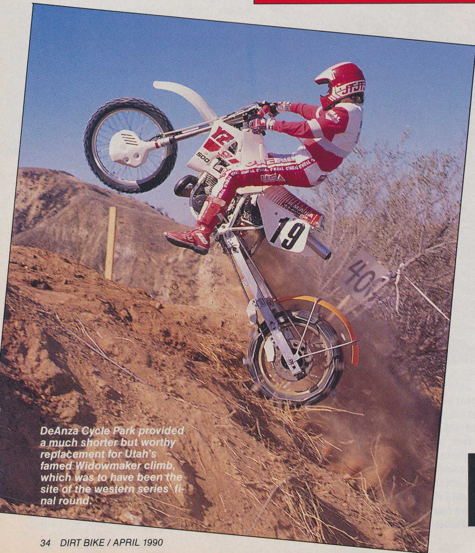
DeAnza Cycle Park provided a much shorter but worthy replacement for Utah's famed Widowmaker climb, which was to have been the site of the western series' final round.