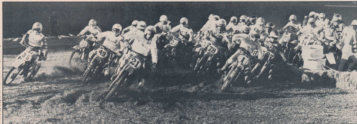
The crowded first turn of a heat, with Hannah up front.