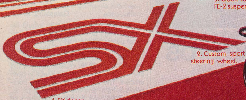
1. SX decor.

We give you five sporty extras at no extra charge.