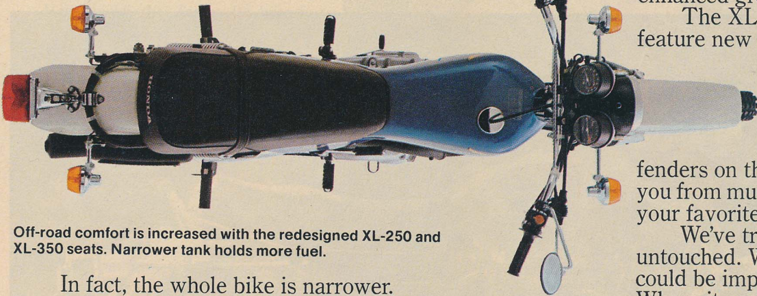
Off-road comfort is increased with the redesigned XL-250 and XL-350 seats. Narrower tank holds more fuel.

In fact, the whole bike is narrower. Something we know today's riders want. The tank, the front of the seat, and the frame itself. The cushioned steel footpegs have been lowered, too, and the revised steering geometry gives better straight-line stability and lets the front end track even more smoothly than ever through the corners.