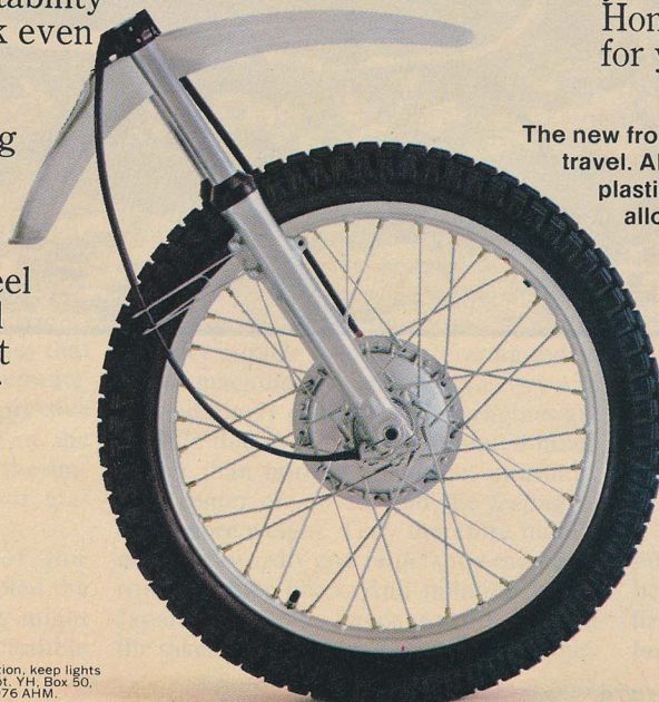
The new front forks provide a full 7.1 inches of travel. Also, note the tough, flexible high-rise plastic fenders and self-cleaning aluminum alloy rims.

And right now there's an especially good feature you won't want to miss—your dealer's low price. Since it's the end of the '76 model year, the XL's are going dirt cheap.