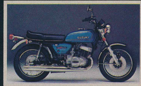
GT500: PEI, front disc brake, 4.5 gal. gas tank, 5 speeds.