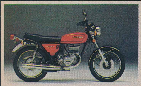
GT185: Electric start, Ram Air, front disc brake, 5 speeds.