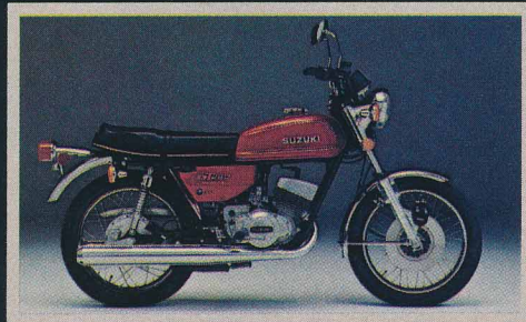
GT250: Primary kick, 28mm carb, front disc brake, 6 speeds.