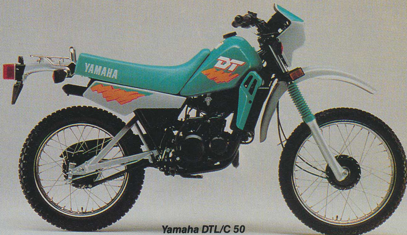
Yamaha DTL/C 50