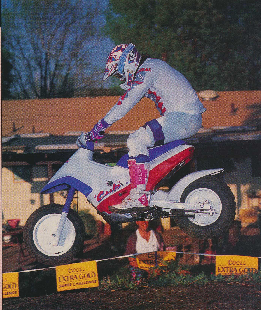
▲ Honda EZ90 Cub

Comments: The least expensive Pee-Wee, the PW50 is a highly-sought-after machine and is more competitive than the JR50. It is faster, stock, than the JR and has more hop-up potential. The PW also has oil injection and a restrictor in the exhaust, but the shaft means you can't alter gearing cheaply. Oddly enough, the motor pivots in the frame. The pipe is quiet and tucked in very well. Like the Buster, the PW50 has mag-styled wheels; only the Yamaha's are steel. It's meant for kids aged four to eight.