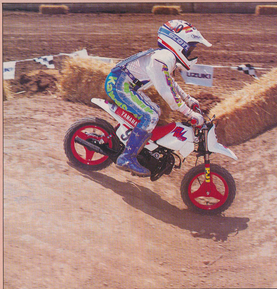
Yamaha PW50 ▼